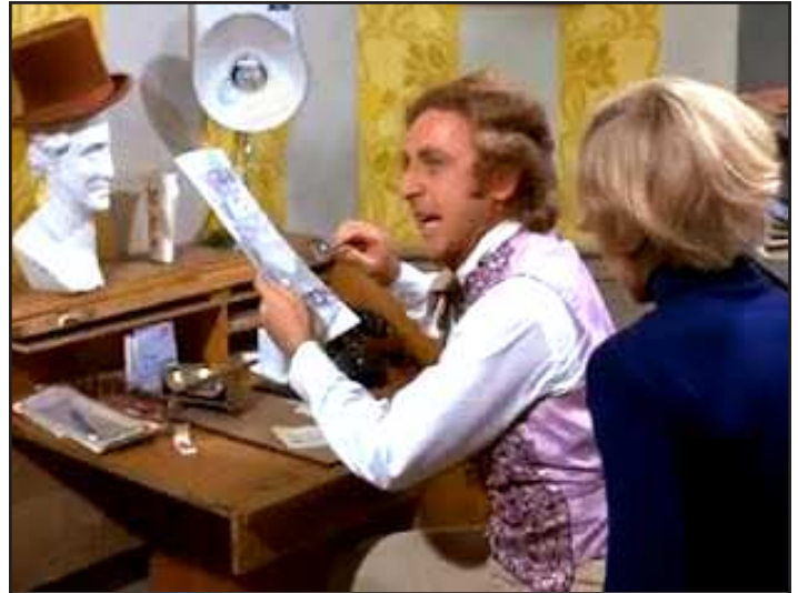
Something is not right in this photo of Willy Wonka and Charley in the chocolate factory office. Can you spot it?